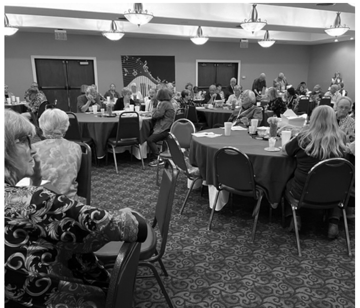
2022 State Convention in Clovis.