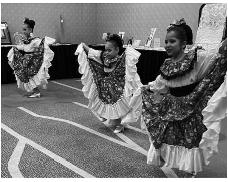
Baila Baila Dancers