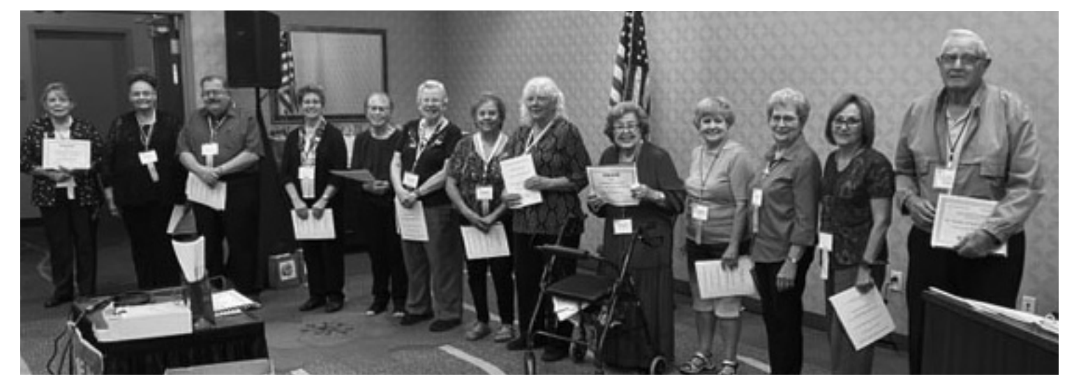
Outstanding Unit Members